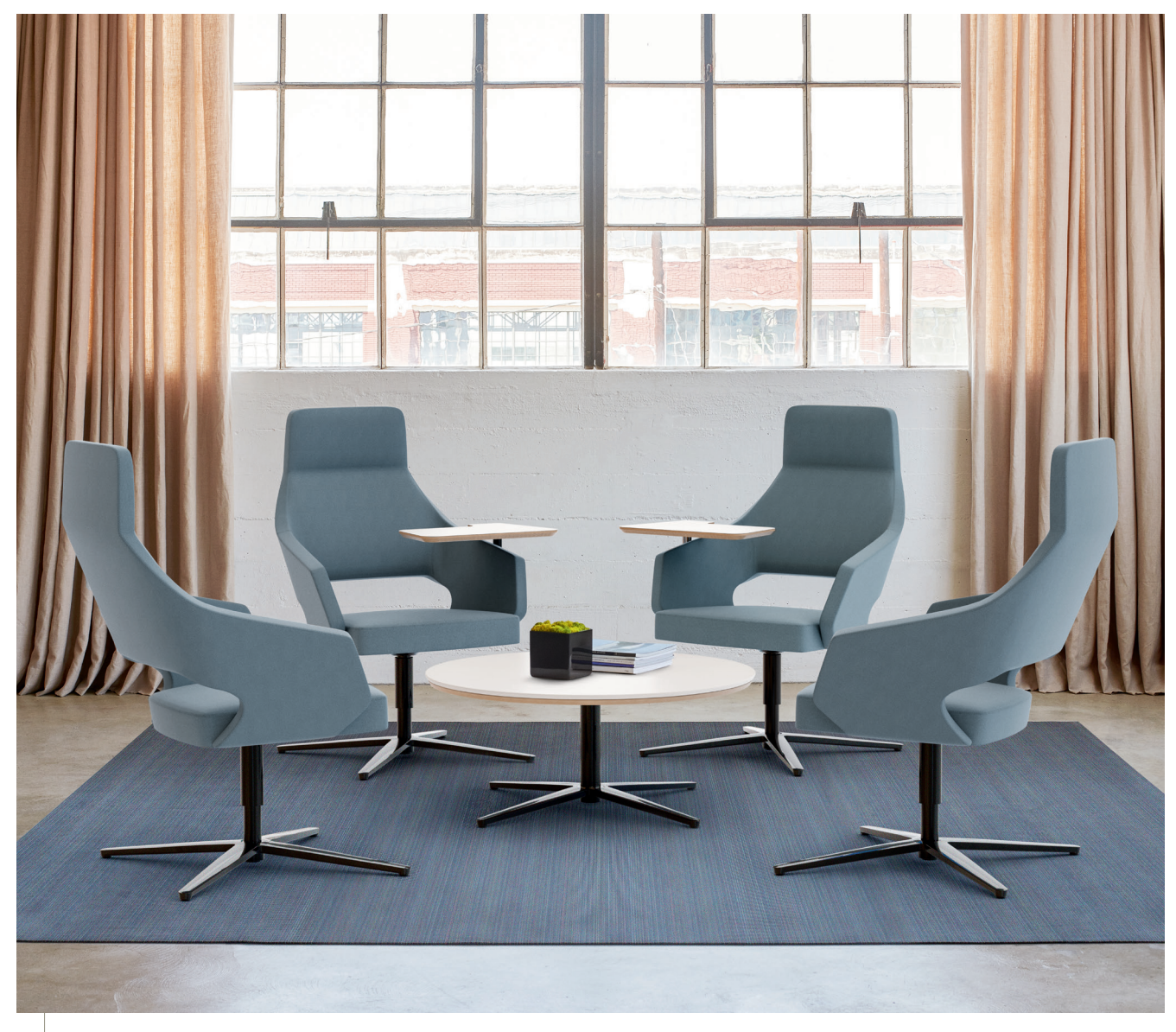
#6926, #6926-TAL07, and #6926-TAR07 High Back Lounge, Swivel Base, together with #FX8-3615-BV-CO Flirt Occasional Table